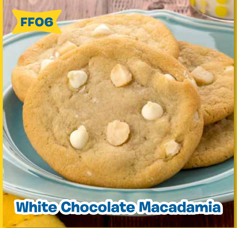
White Chocolate Macadamia