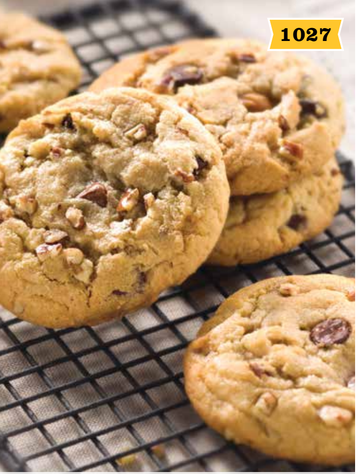
Caramel Pecan Chocolate Chip • $22