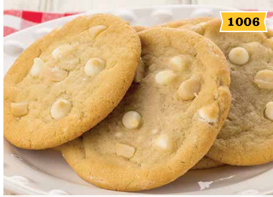
White Chocolate Macadamia • $22