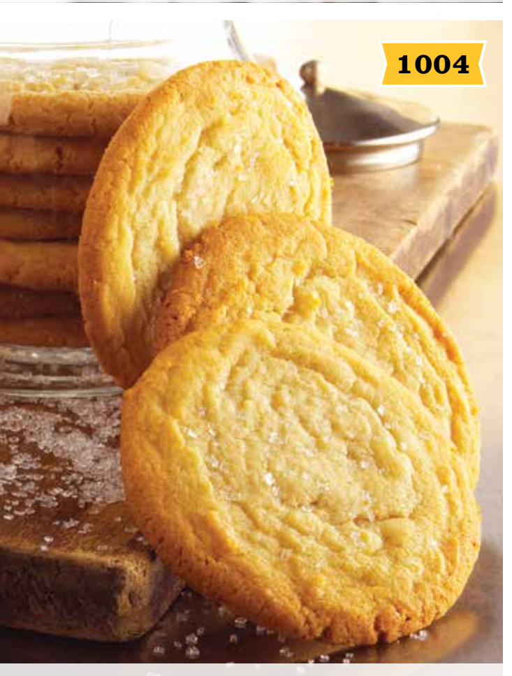
Sugar • $22