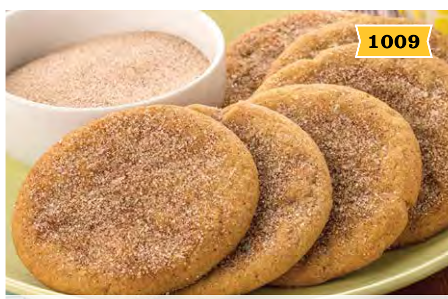
Snickerdoodle • $22