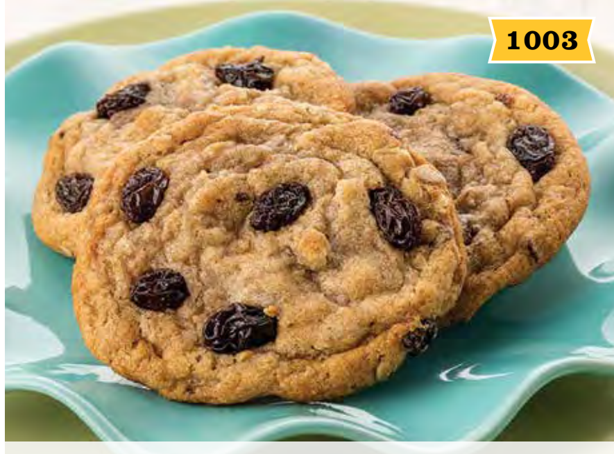
Oatmeal Raisin • $22