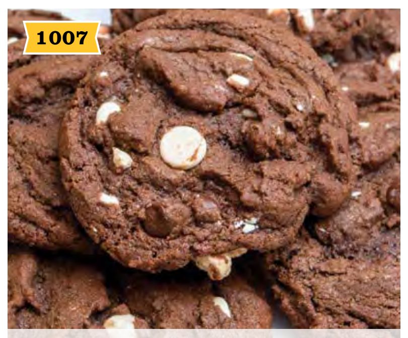
Triple Chocolate • $22